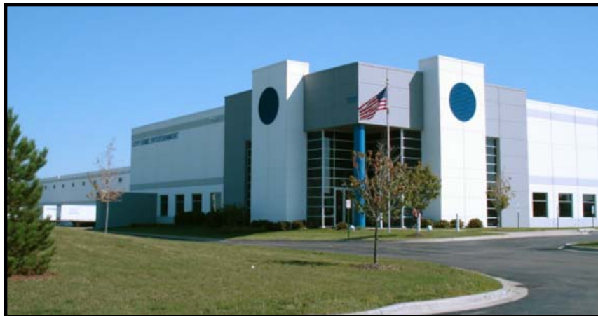
SPX leases 231,000 SF from RREEF in Romeoville

SF. Market sources tell us that Sony has exercised their downsizing provision and as such there will be 176,000 SF available for lease in the Crossroads Lakes #1 building.